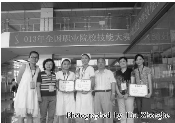
Photographed by Liu Zhonghe

(Liu Zhonghe from Red Cross Health School)